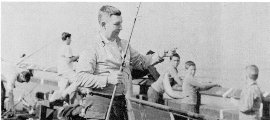
Mr. Whitson setting the example.

We boarded the Redondo Beach (cont. on page 4)