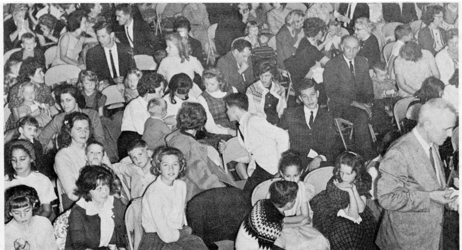
Part of the crowd--sitting pretty!

However, keep a date open for February 9, for the next event. Details will be announced later.